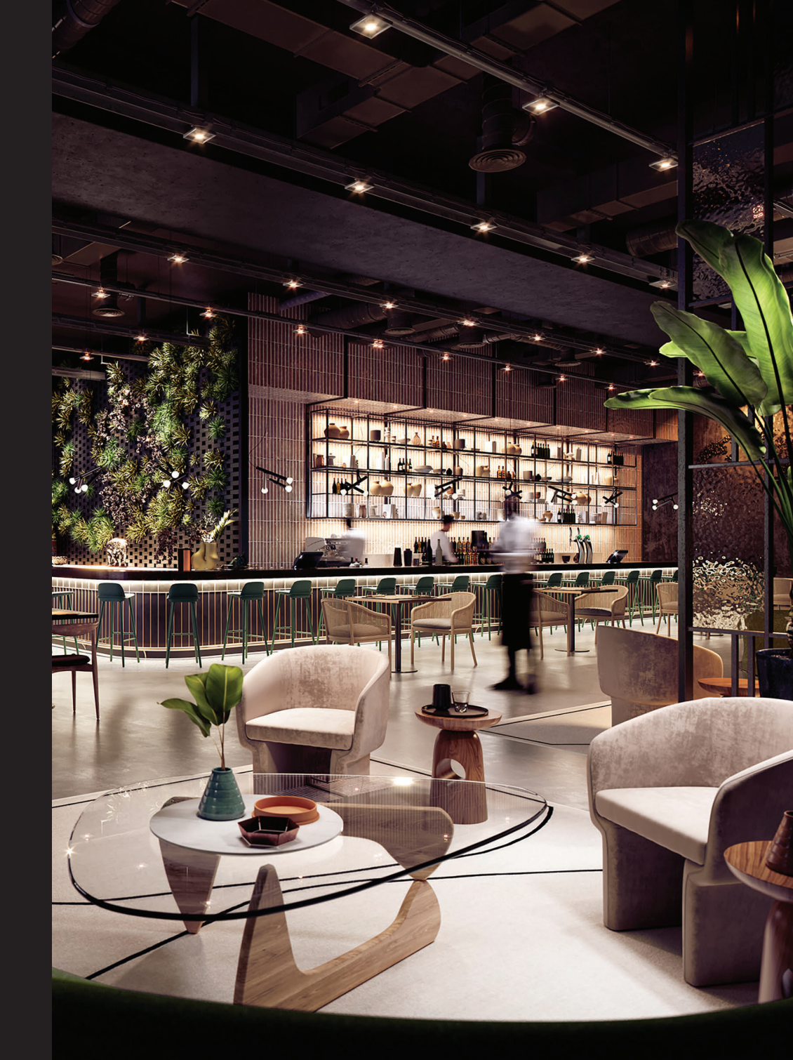
Ground-level restaurants and retail

Cutting-edge cuisine. Sophisticated shops. Millie's ground-level retail and restaurant space will buzz with 25,000 square feet of energy and light. Access the city's premier food, beverage, and lifestyle destinations just downstairs. Coming soon!